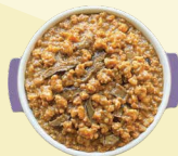
香菇肉燥 Braised Minced Pork with Mushroom