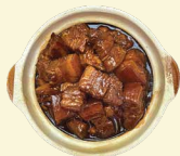
東坡肉 Dongpo Braised Pork Belly