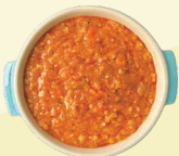
意式鮮茄豬肉醬 Pork Bolognese Sauce